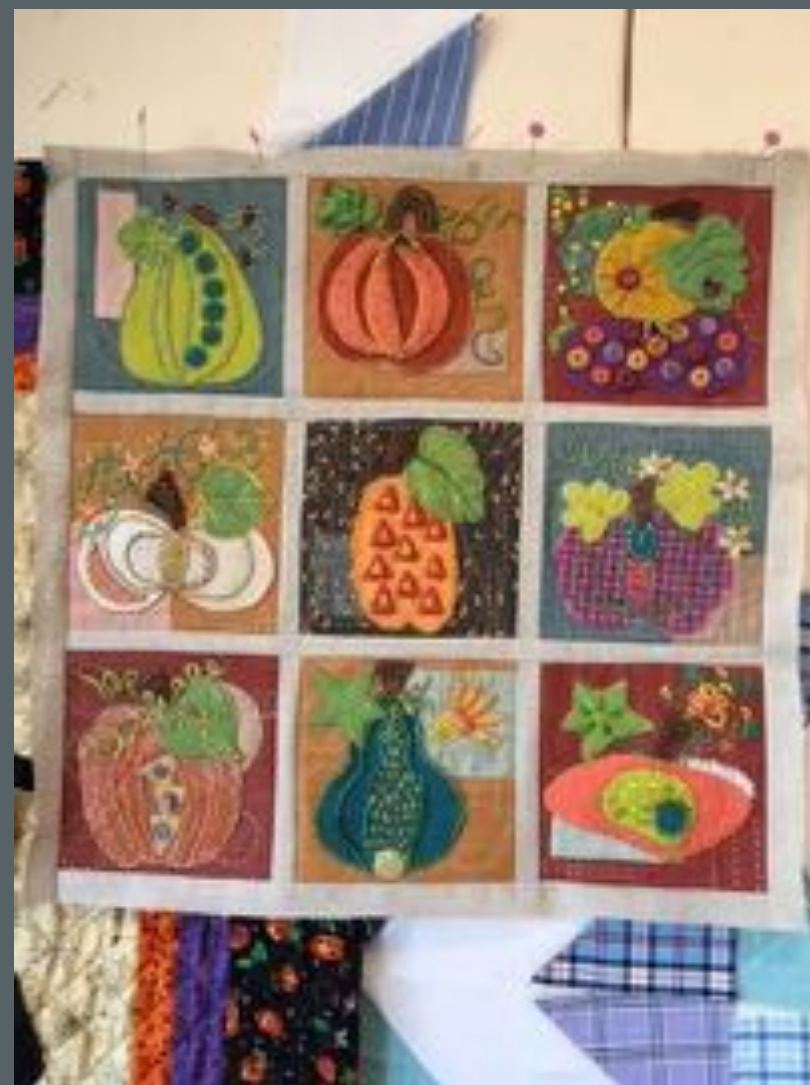
Another Sue Spargo pattern with gorgeous appliques.