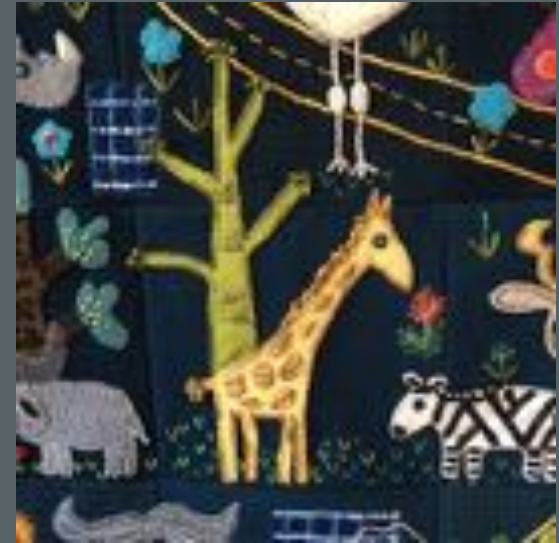
More Carolyn's wall hanging close up views Sue Spargo pattern