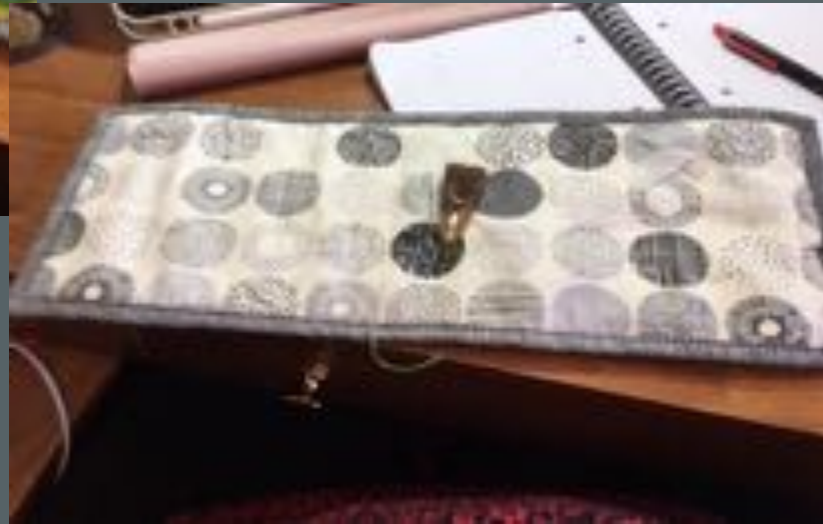
Carolyn used a Sue Spargo pattern to make a needle roll.