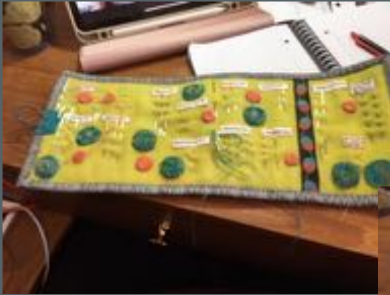
Top – front , right - back