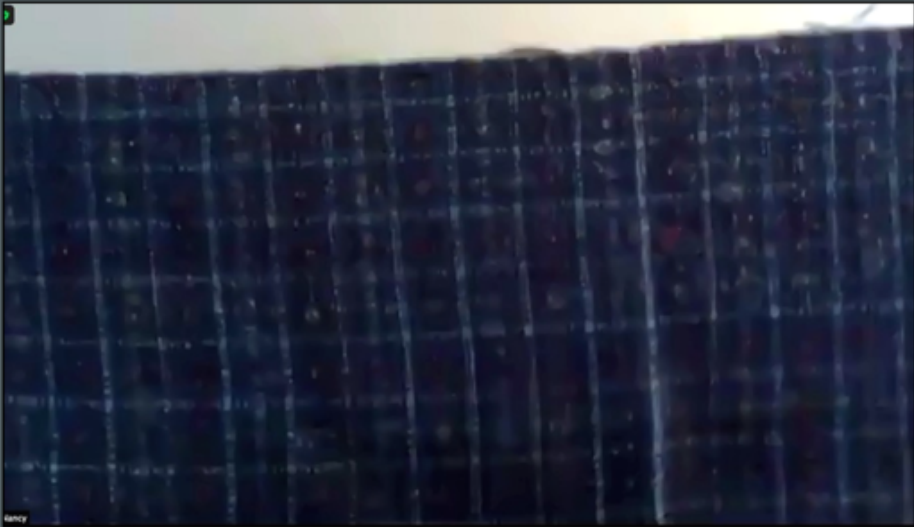
Nancy E showed wool fabric she is going to use to make a jacket and a skirt. See the very top of her head, she's hiding! Zoom screenshot