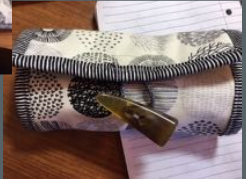
Closed w button trim